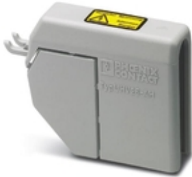
Covering hood, length: 91 mm, width: 28.8 mm, height: 59 mm, color: gray

Please be informed that the data shown in this PDF Document is generated from our Online Catalog. Please find the complete data in the user's documentation. Our General Terms of Use for Downloads are valid ( http://phoenixcontact.com/download )